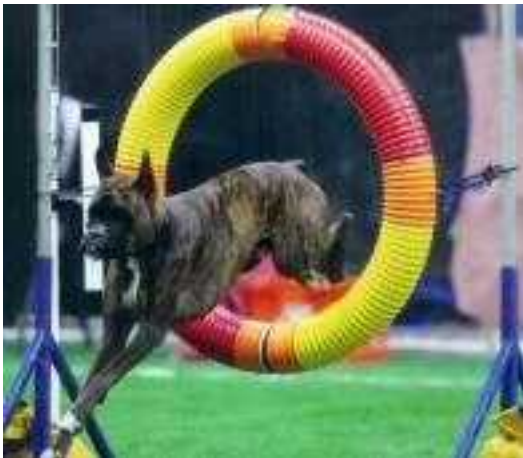
Prairie Hill's It's All About The Smoke CD, BN, OA, OAJ , RE, TKI "Smokey" Handled / Trained / Owned by: Pat Senne