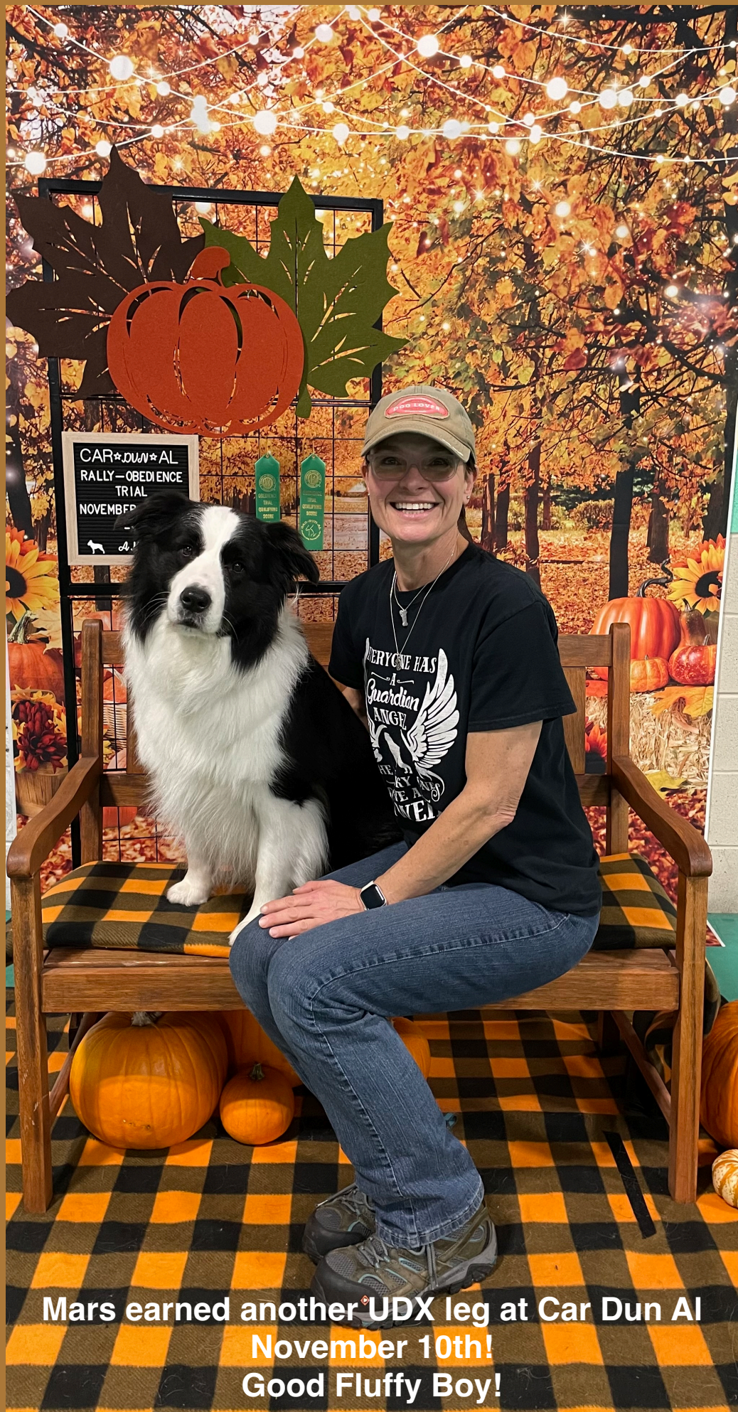
Mars earned another UDX leg at Car Dun Al November 10th! Good Fluffy Boy!