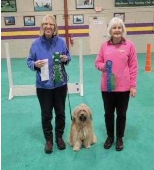
Buttercup DSCHO UTRAA' NYE-TSHOR CGC CD CDX Earned in 2023 CDX Owned, Trained/Handled & Loved by Cathy LaBash