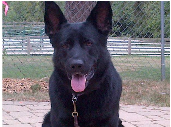
Feuer Bombe Vom Landschaft "Bubba"