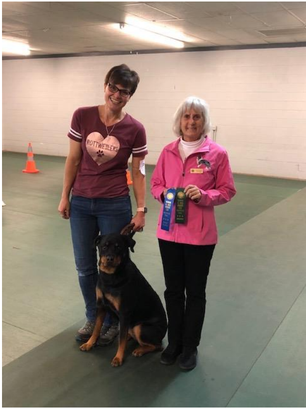
Windy at GABOC- 1 st Preferred UD leg and a 196 in P-Open to achieve our highest score to date!