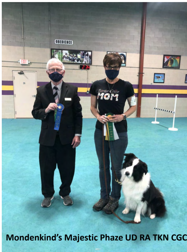
Mondenkind's Majestic Phaze UD RA TKN CGC