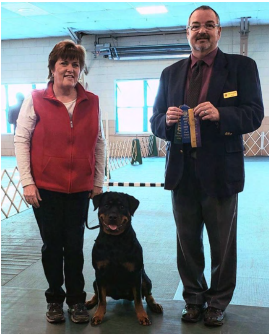
Blackwood Princess of Claddagh UD , CGC, CS, CI, CS-T "Teagan"