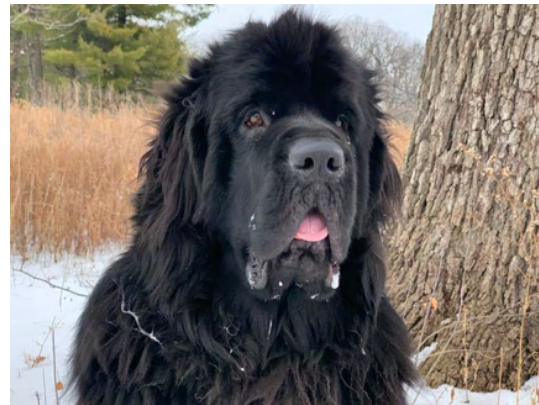
Shadrack's Surfing The Motion Of The Ocean CGC , S.T.A.R. Puppy "Swell"