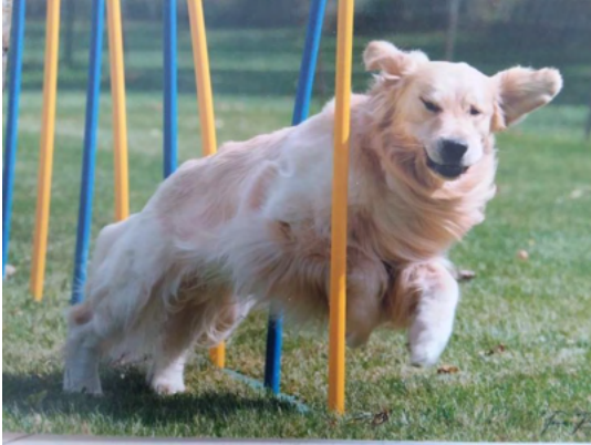
Believe's Winning Ways CD, OA , OAJ, XF "Winston"