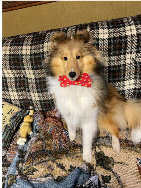
Goodwin Dealer's Choice CGC "Chip"

Handled / Trained / Owned by: Cathy Haake