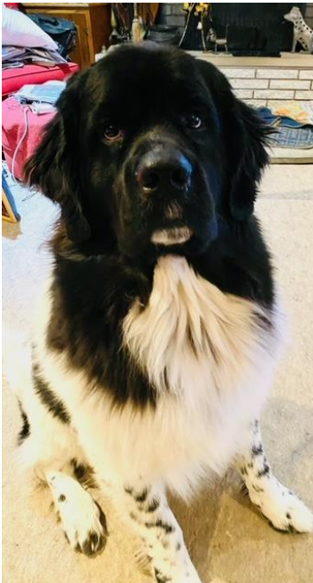
Ebb Tide's Zorro the Legend Continues BN , CGC, TKN, TDI "Zorro"