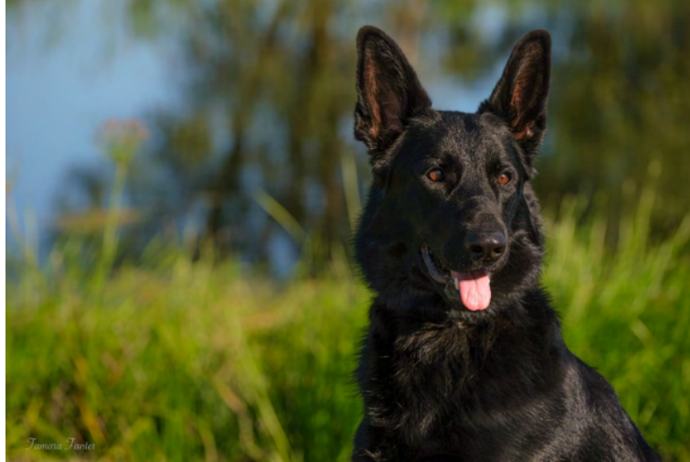
Diva Vom Alten Flakturm

CD RI FDC ACT2 CGCA CGCU TKI TKN, NW1, RN, NTD, ITD, ACT1