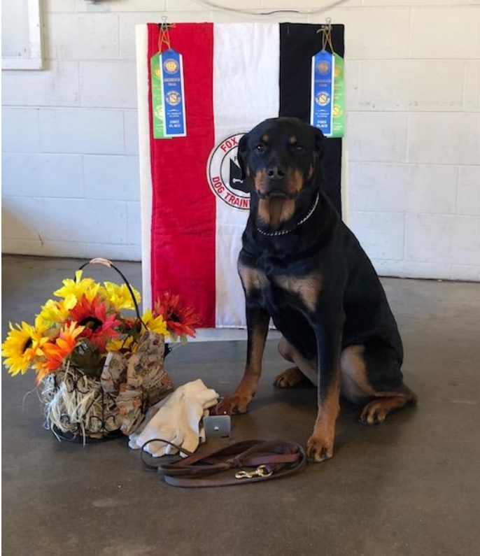
Fox Valley brings more success as Windy earns PUDX leg #2 with another 197 in Preferred Open and Mars earns 4 th Utility A leg!