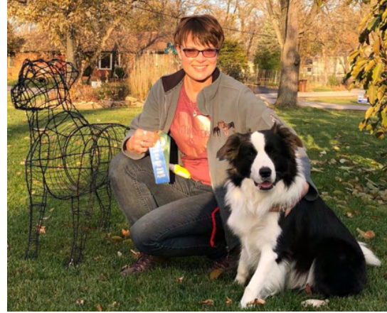
Mondenkind's Majestic Phaze CD , RA , TKN, S.T.A.R. Puppy "Mars"