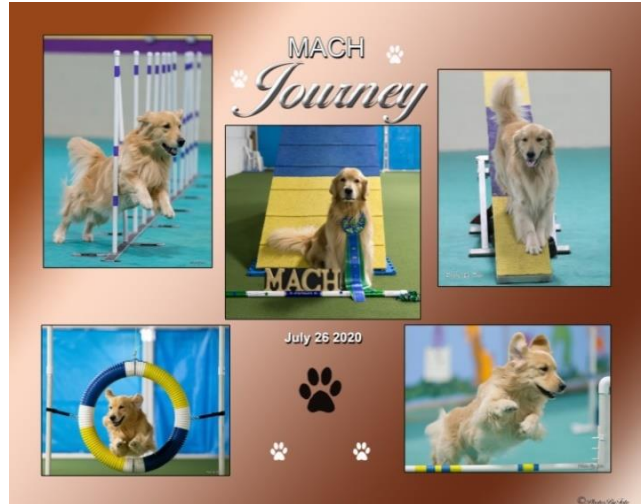
MACH CH Goldberry Bullion Don't Stop Believing UD, MXG , MJS "Journey" Handled in Performance / Trained / Owned by: Peggy Covey Co-Owned by: Karin Boullion