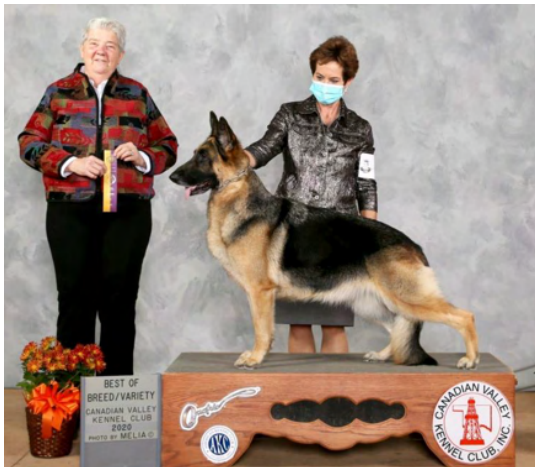
GCHB CH Glenwood's Sassy Sunshine Girl RN, CGC, Achiever Dog, HIC, OFA H/E "Elsa"